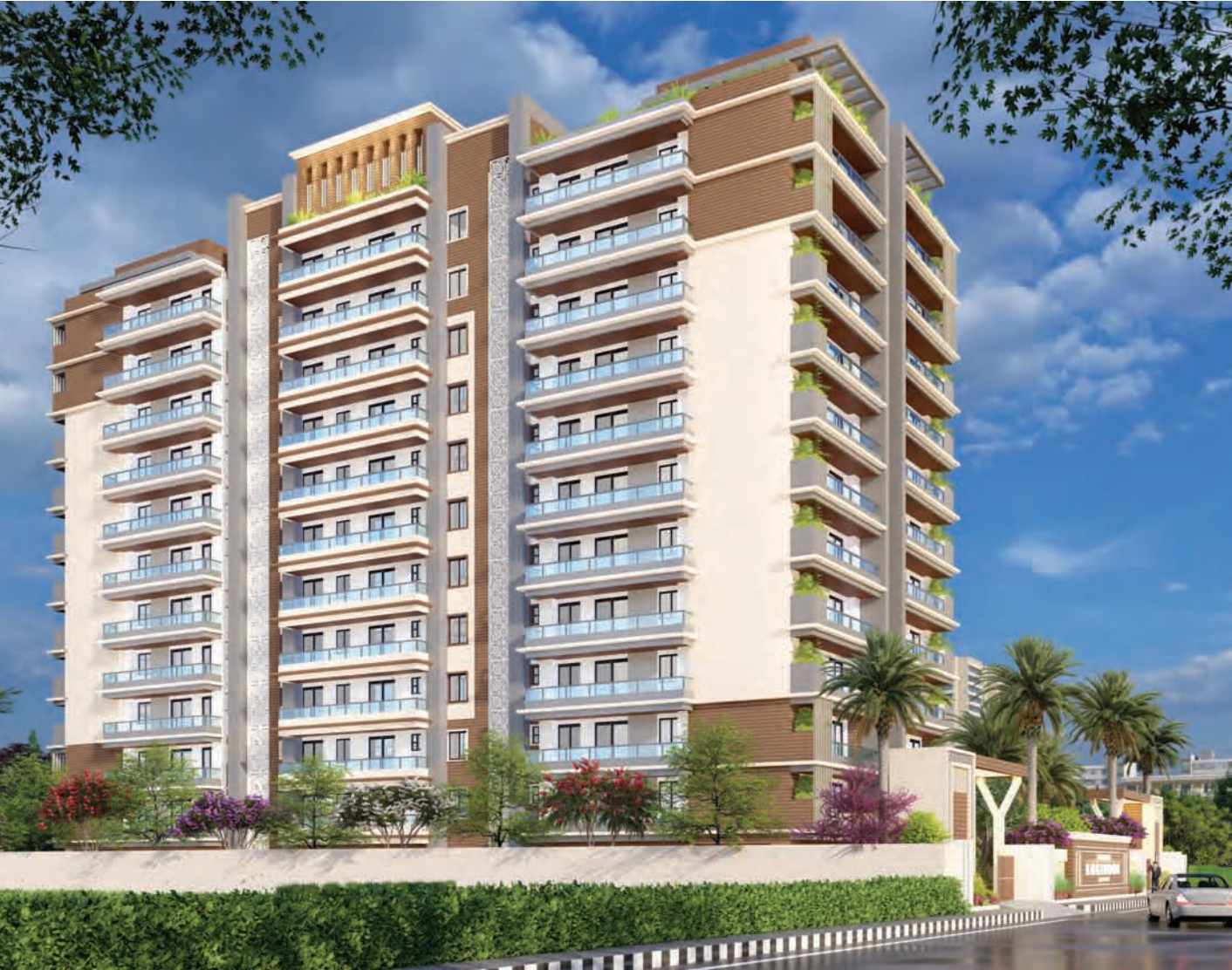
An Artist's impression of the THE WOODS KOHINOOR JANKIPURAM

Just at a two minutes drive from the Tedhi Pulia crossing on Kursi Road, Aesthete Infra Ventures is coming up with its eleven story Residential complex THE WOODS KOHINOOR JANKIPURAM for you.