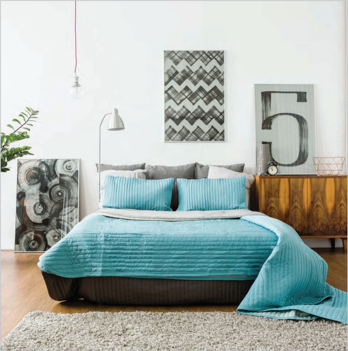
Representative image of a bed room