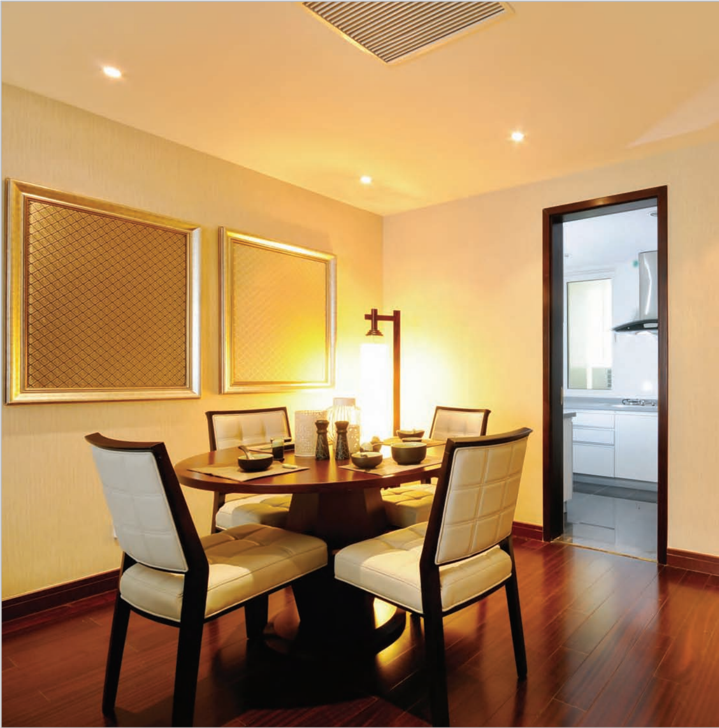
Representative image of a dining area