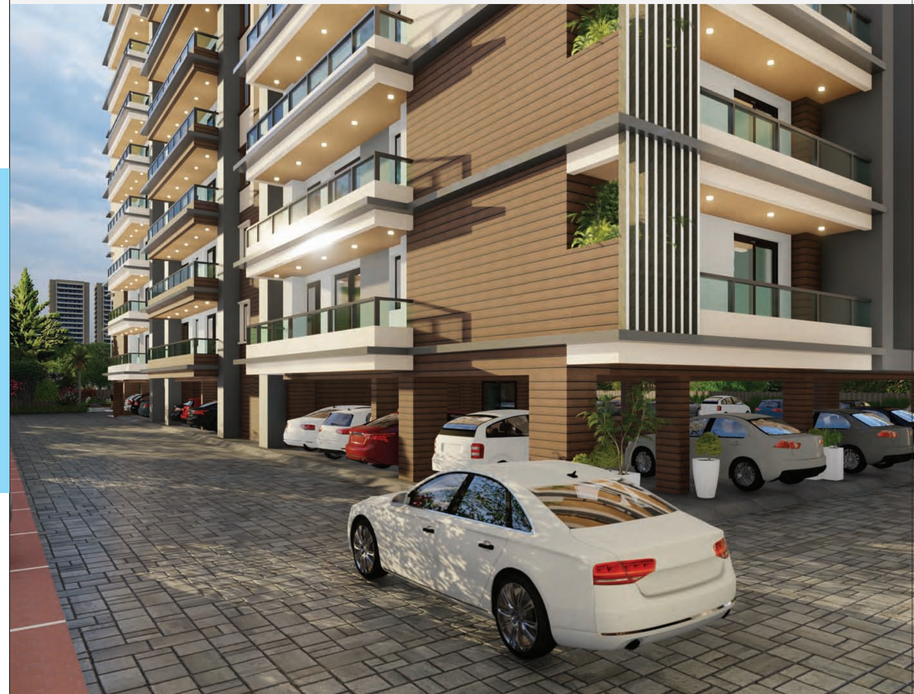
Artist's impression of the 6 meter wide driveway