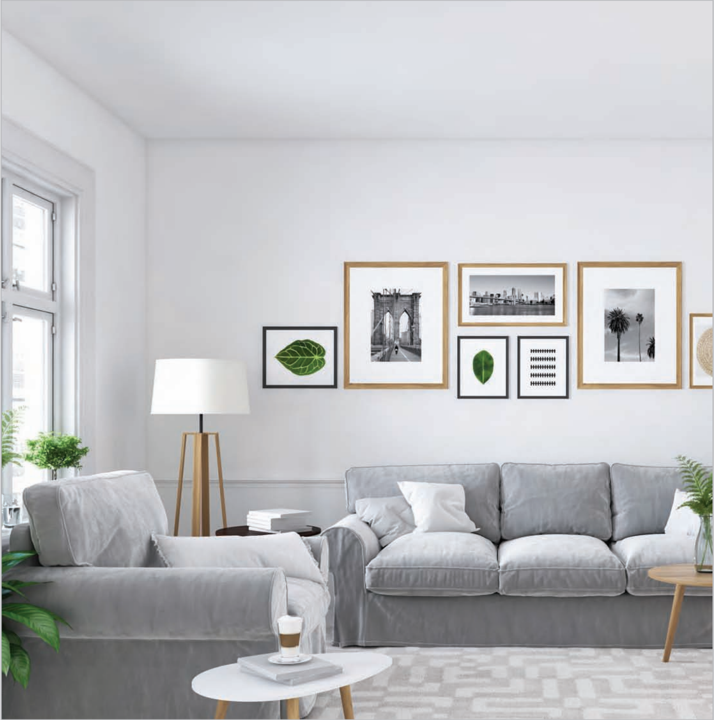
Representative image of a living room