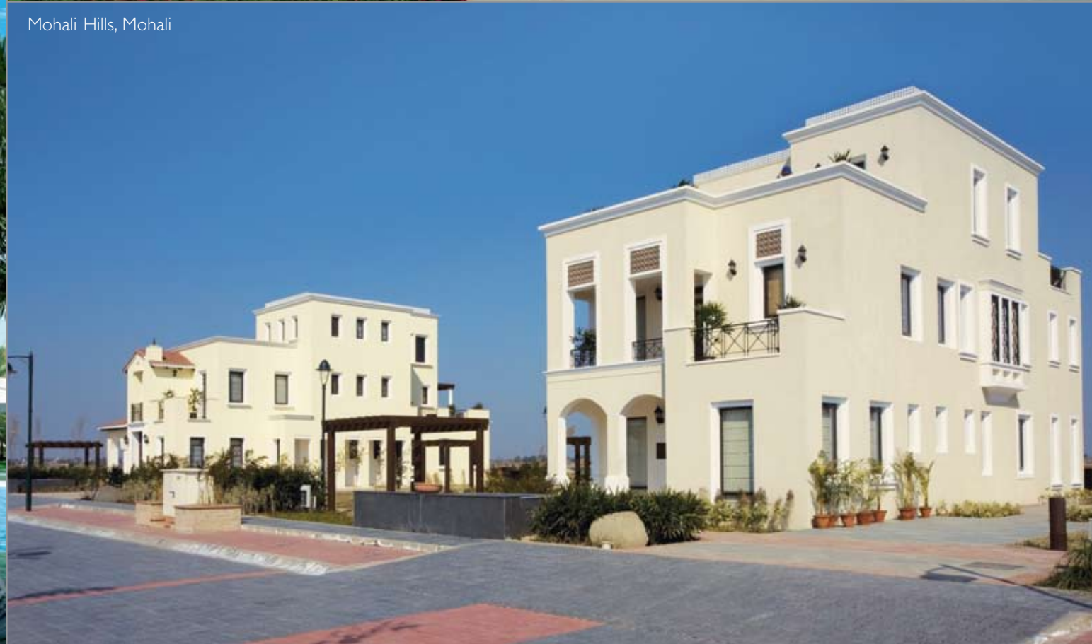
Mohali Hills, Mohali