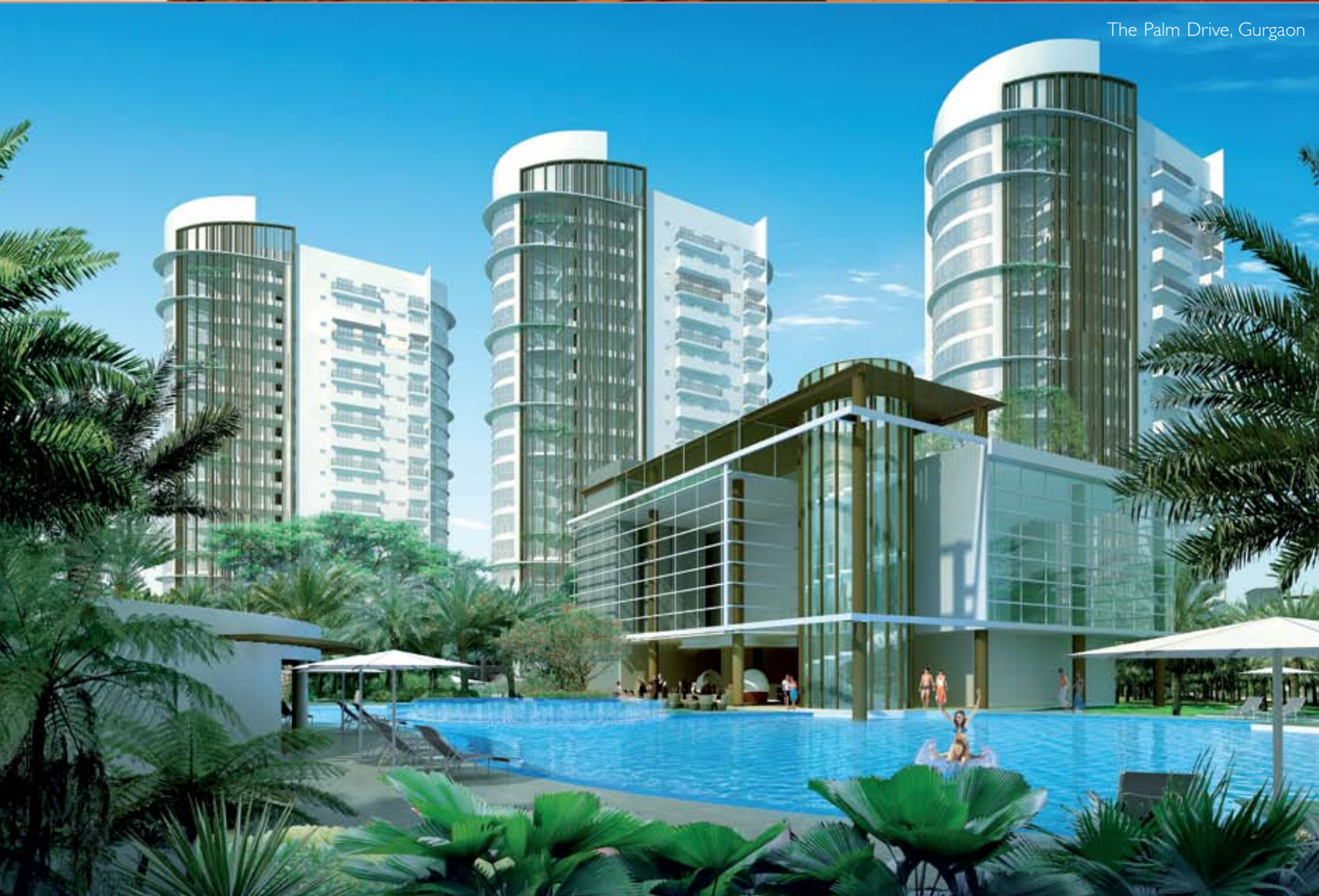
The Palm Drive, Gurgaon