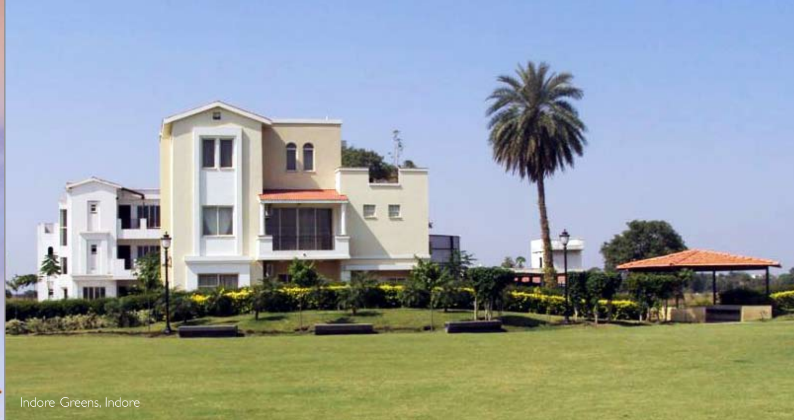
Indore Greens, Indore