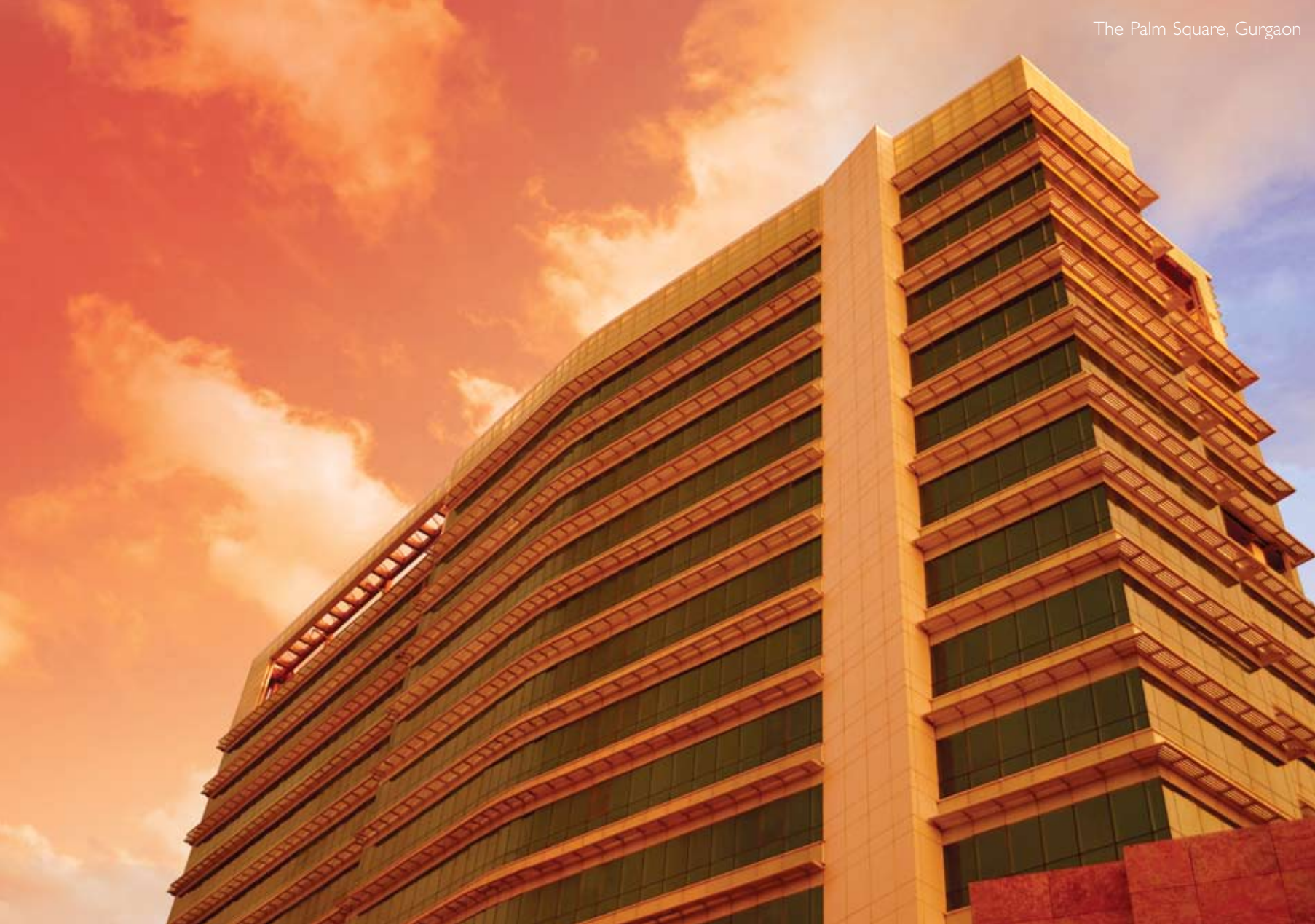
The Palm Square, Gurgaon