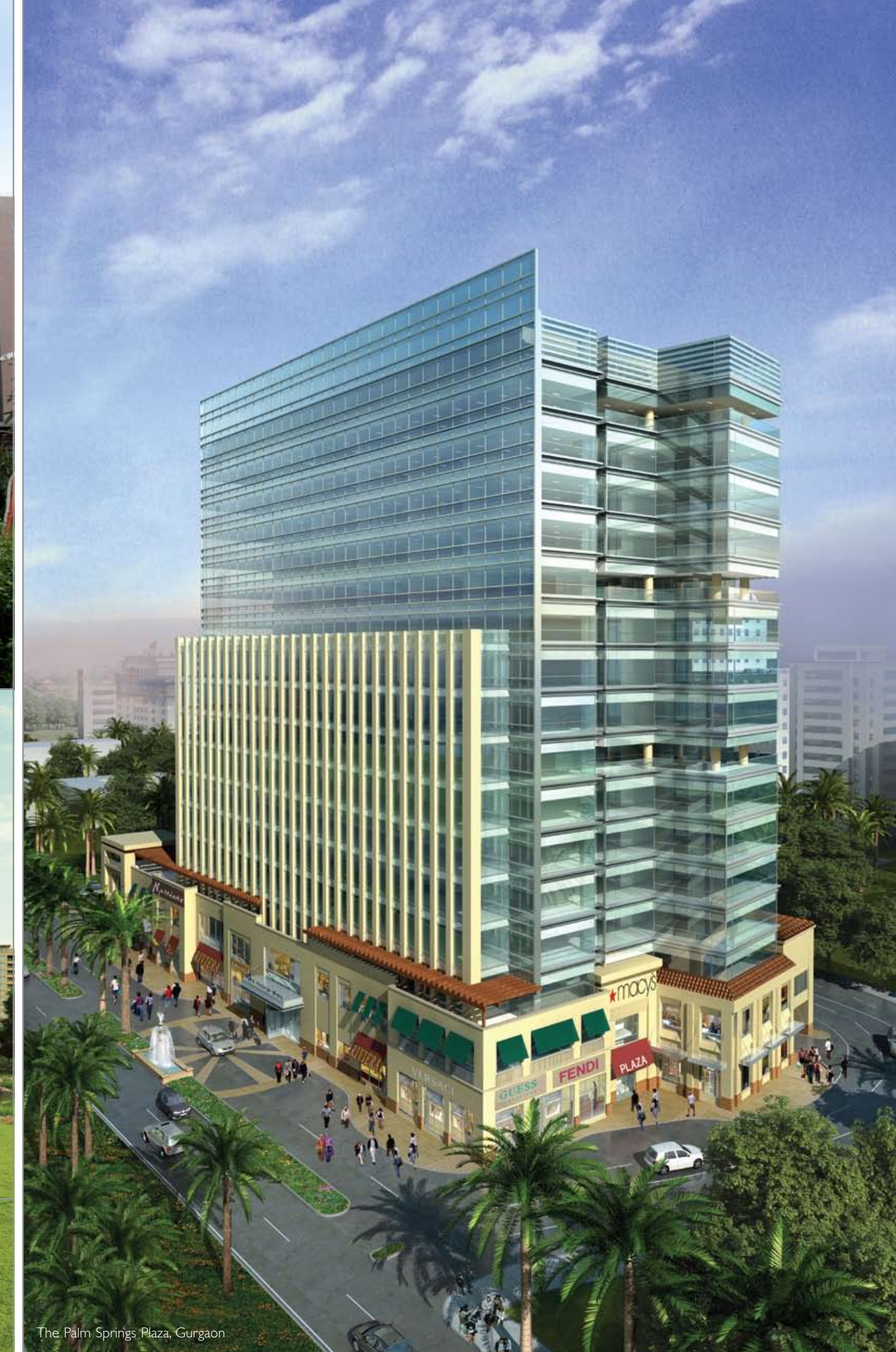
The Palm Springs Plaza, Gurgaon