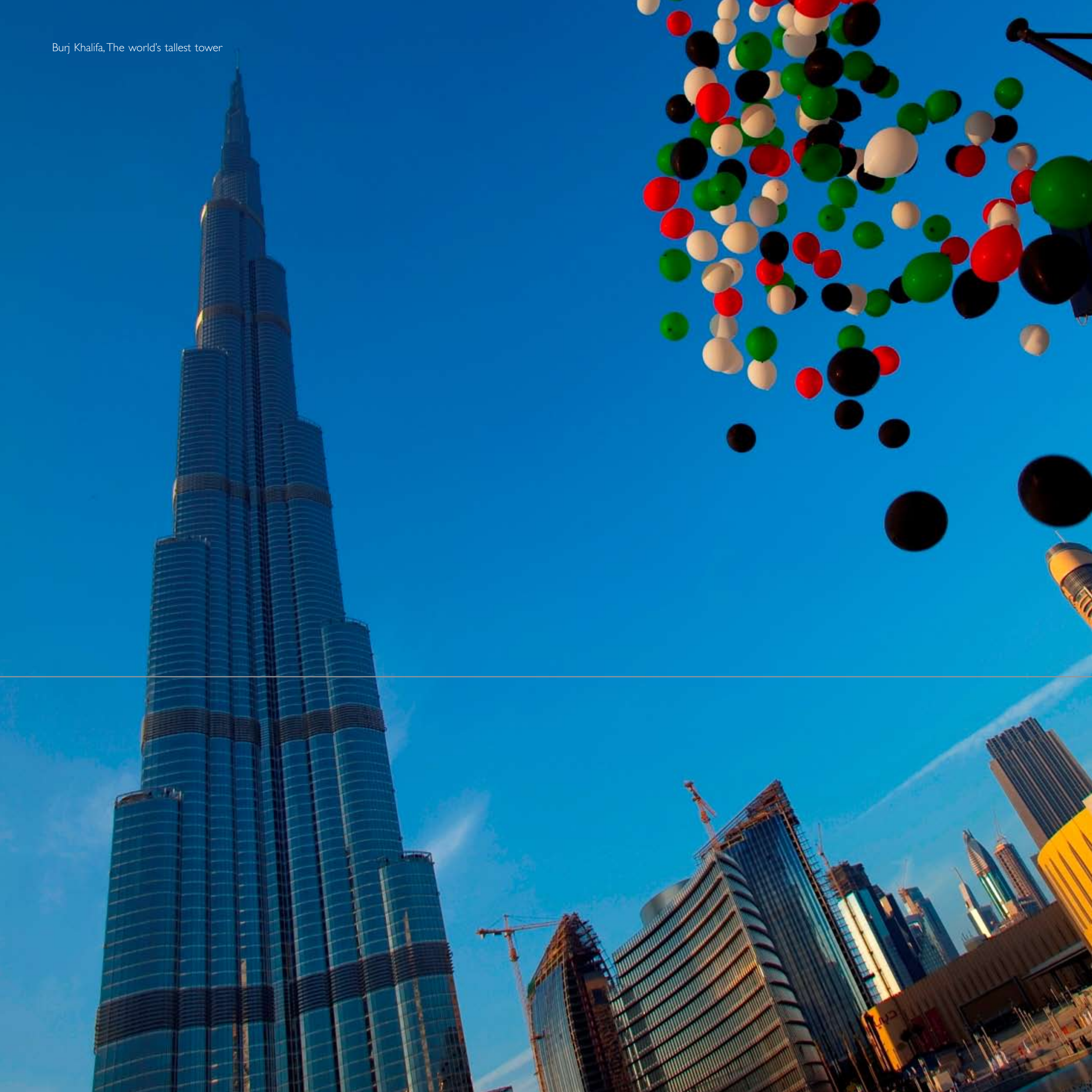
Burj Khalifa, The world's tallest tower