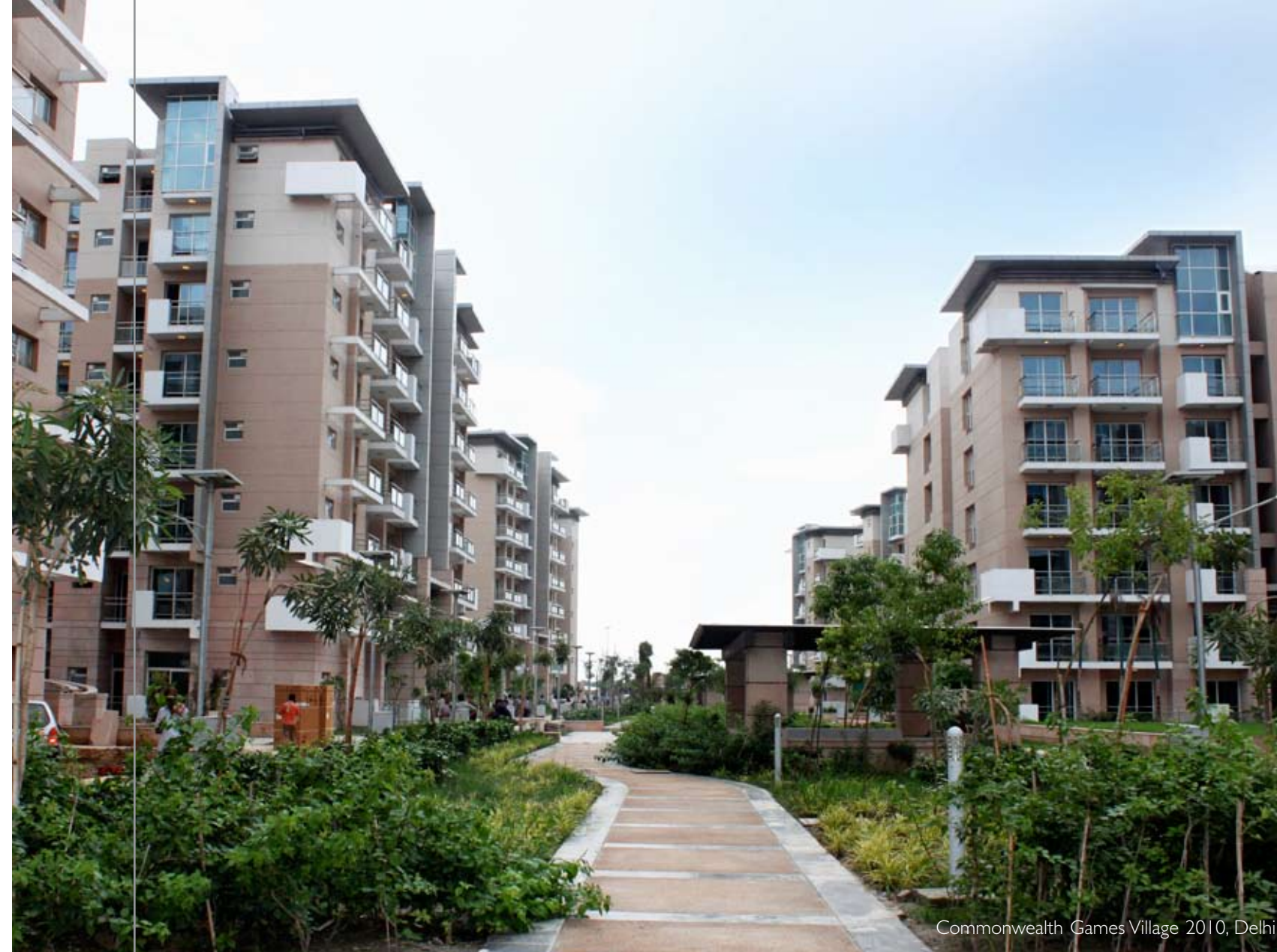
Commonwealth Games Village 2010, Delhi

Emaar MGF commenced operations in India in February 2005 and is into real estate construction-development with a pan-India presence and operations spanning all key segments of the Indian real estate industry, namely the residential, commercial, retail and hospitality sectors. The Company's operations encompass various aspects of real estate development, such as land identification and acquisition, project planning, designing, marketing and execution. At present, its focus is on the development of residential projects in Delhi, Gurgaon and elsewhere in the NCR, Mohali, Hyderabad, Chennai and other key Indian cities.