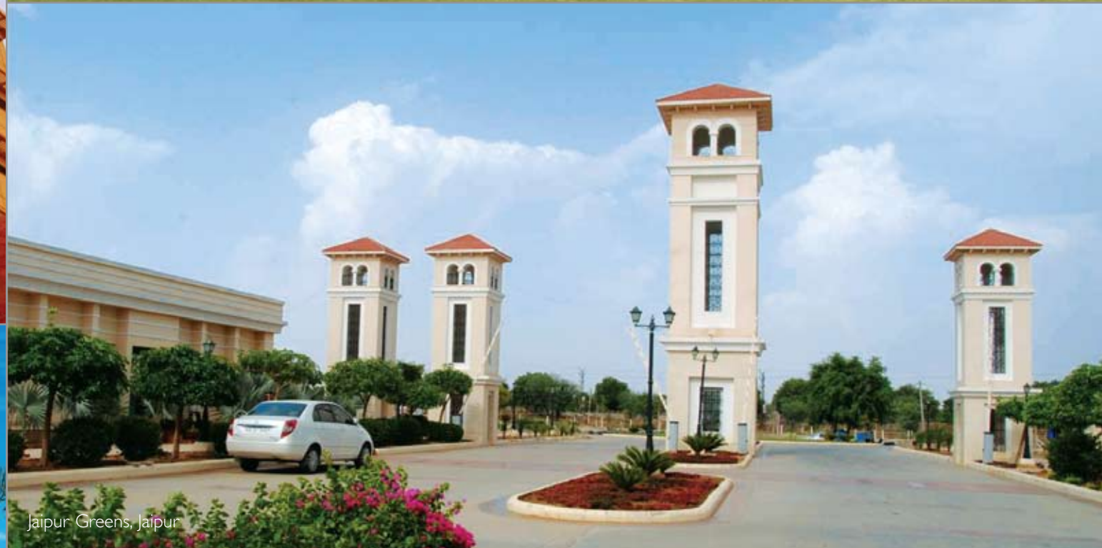
Jaipur Greens, Jaipur