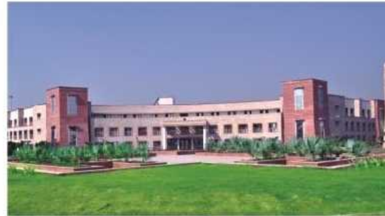
▲ Hostel Block at Gautam Buddha University