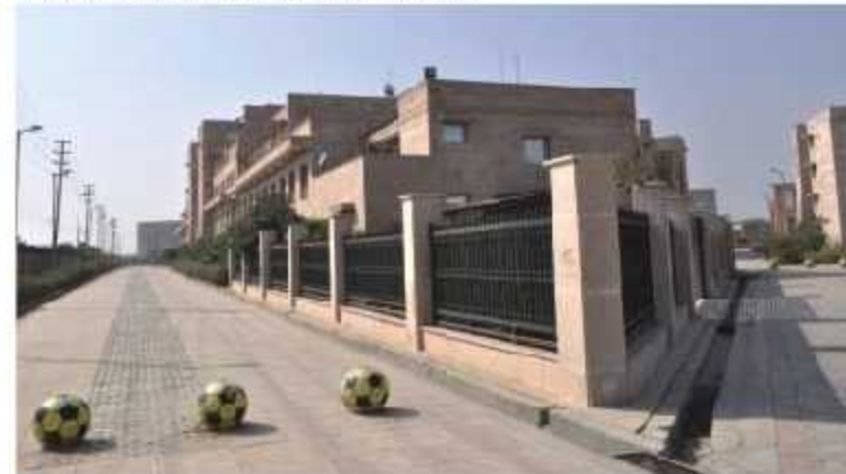
▲ Residential Block at Gautam Buddha University