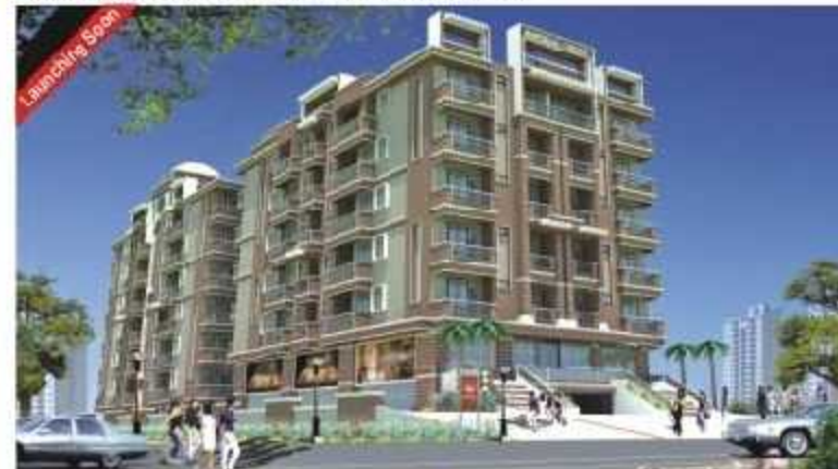
▲ Commercial cum Residential Complex at Gorakhpur

Imperial Crest 2, 3, 4 BEDROOM APARTMENTS