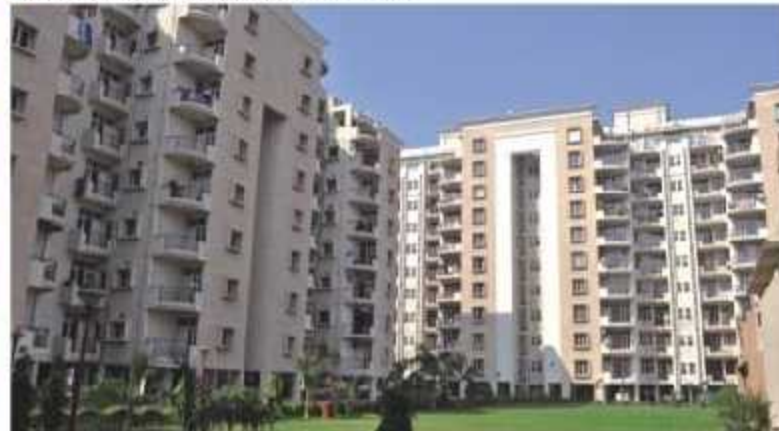
▲ Gandharva Apartments at Greater Noida