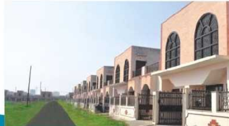
▲ Independent Residential Houses at Greater Noida