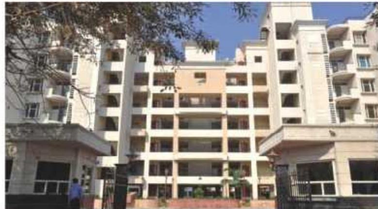
▲ Group Housing Project at Greater Noida