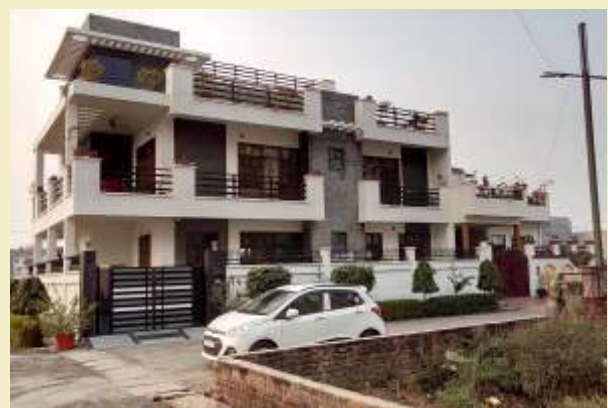
Omega Shopping Center