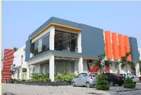
Omega Club House