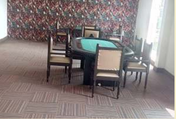
Green Park Apartments